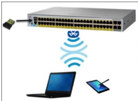
Figure 2. Over-the-air switch access using Bluetooth